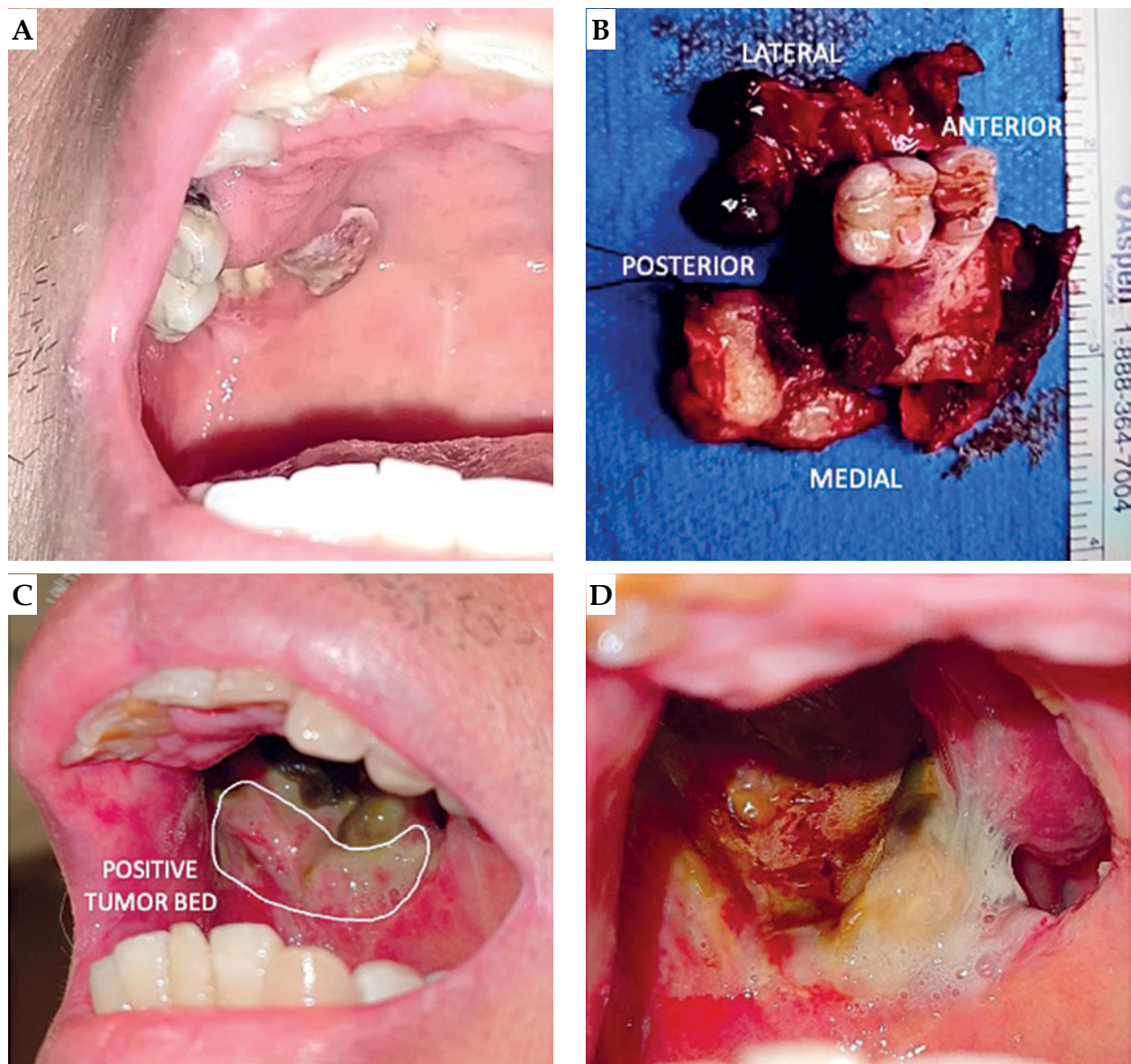
Fig. 1. A) Residual disease post-chemoradiation. B) Posterior maxillectomy specimen. C) Positive posterior and lateral aspects of the tumor bed. D) Grade 2 radiation mucositis at two weeks post-brachytherapy

IIB, III, IVA, and IVB to 56 Gy, given as sequential boost using intensity-modulated technique over 35 daily sessions in 7 weeks, with concurrent weekly cisplatin 40 \text{ mg/m}^2 . Follow-up CT at four months post-CRT showed a 1.8 \times 1.8 \times 2.1 cm residual mass with minimal enhancement and mass effect, and no neck adenopathy. He was advised either surgery or chemotherapy, and opted for surgery due to tumor-related pain. At five months from completion of CRT, the patient underwent right posterior Brown class IIA maxillectomy. The involved alveolar segment was removed along with the lateral and posterior maxillary walls and hard palate (Figure 1A, B). Orbital floor was preserved, and no reconstruction or neck dissection was performed. Histopathology showed residual keratinizing SCC. Posterior and lateral margins were positive, while the rest of the margins were uninvolved. He was then referred for adjuvant BRT.